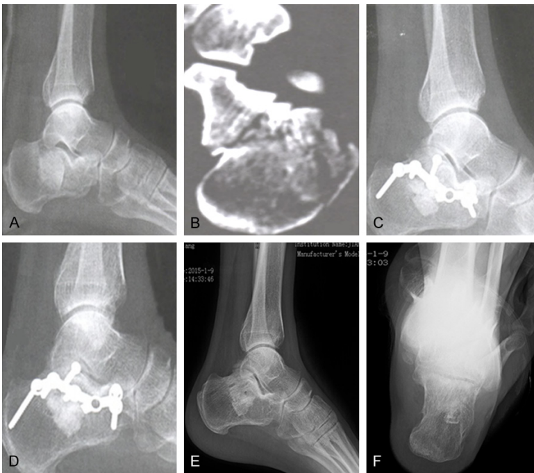
Figure 2. One case of intra-articular joint depression type calcaneus fractures treated via sinus tarsi approach with modified calcaneal plate (n=48 feet, 40 patients). A. Preoperative X-ray image of calcaneus. B. Preoperative CT film image of Sanders III fracture. C. Postoperative X-ray image of calcaneus (showed satisfied fixation). D. X-ray image after fracture healing (no significant loss of reduction). E, F. X-ray images after removal of internal fixation.