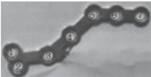
Figure 3. Modified calcaneal plate.

formed using regular calcaneal anatomic plate fixation via sinus tarsi approach or other minimally invasive approaches, but it also require extensive dissection of the lateral calcaneal soft tissues, and is difficult to position a plate properly [21, 22]. The modified plate used in our group of patients derives from a regular calcaneus plate. The narrow shape makes it easy to insert into the incision, and only a small area of soft tissue dissection is needed at the superior border of the lateral wall, to achieve a minimally invasive operation. The modified plate doesn't cover and depress the lateral wall directly, but can reduce and maintain the geometry of the calcaneus by ligamentotaxis, and promotes restoration of the width of the body and integrity of the lateral wall [23].